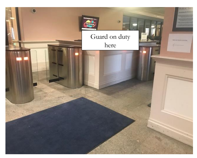
He/she can direct you toward the Heyman Center, which is through another set of double glass doors.

In the lobby of the East Campus complex, check in with the guard seated at the guard turnstile.